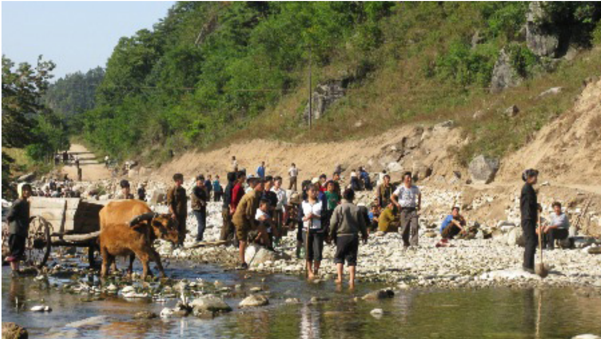
Figure 3. Local population constructing roads.