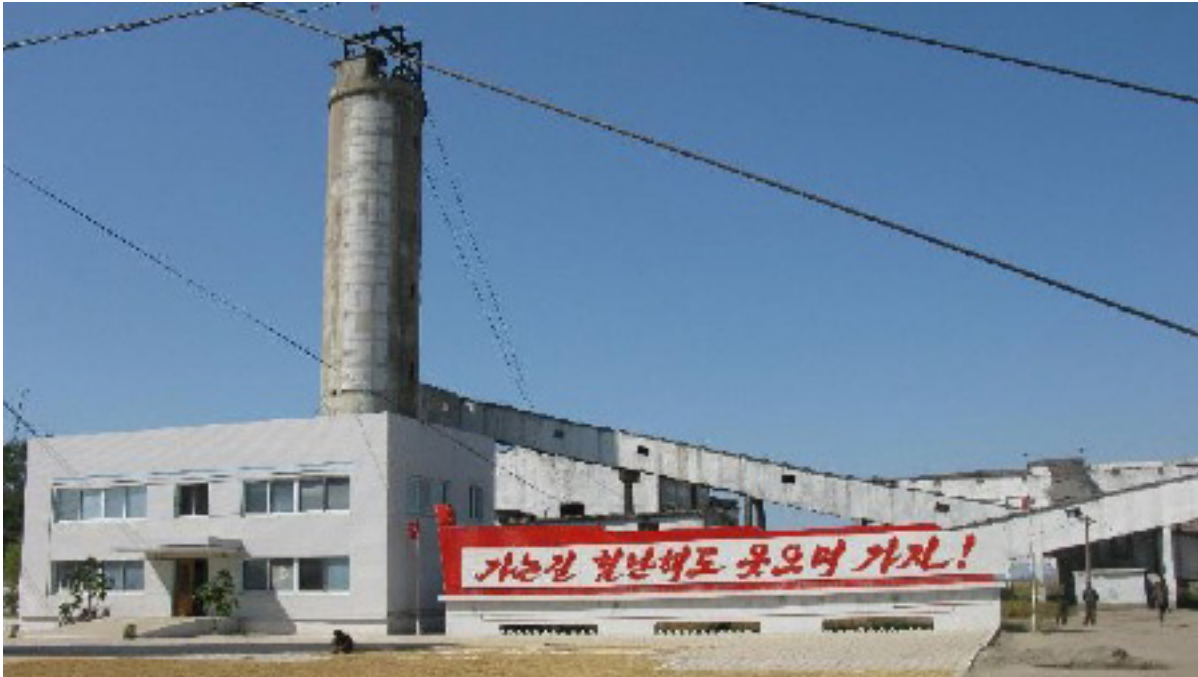
Figure 5. Hwapung Coal Mine.