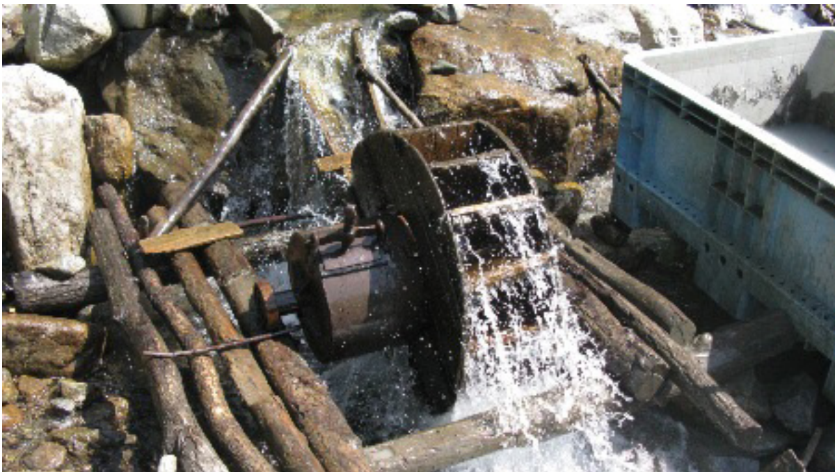
Figure 4. Water-based ball mill.