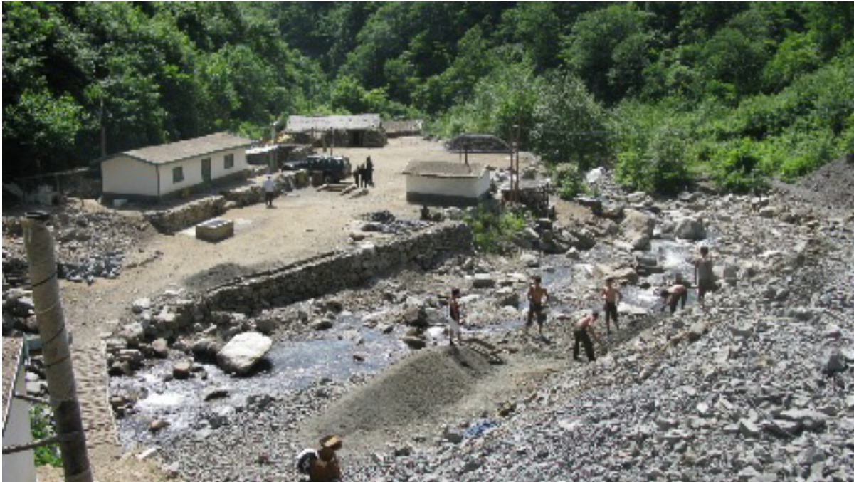
Figure 2. One of several ore bodies at the Sinhung Gold Mine.

shovels—with an ox-drawn wooden cart crossing a stream. The caption below the photo read, “Local population constructing roads.” Other images showed a rickety “water-based ball mill” made from wood and a shabby processing plant at North Korea’s Hwapung coal mine. 116